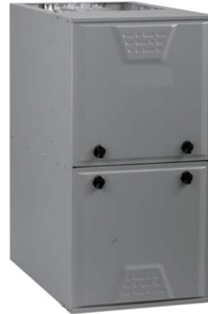
Illustrations and photographs are only representative. Some product models may vary.

* For owner occupied, residential applications only. See warranty certificate for complete details and restrictions, including warranty coverage for other applications.